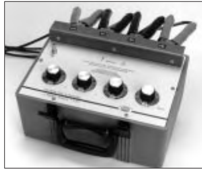
Calibration reference transformer

The auxiliary transformer includes all the necessary cables for connection