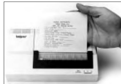
An optional printer provides hard-copy documentation.