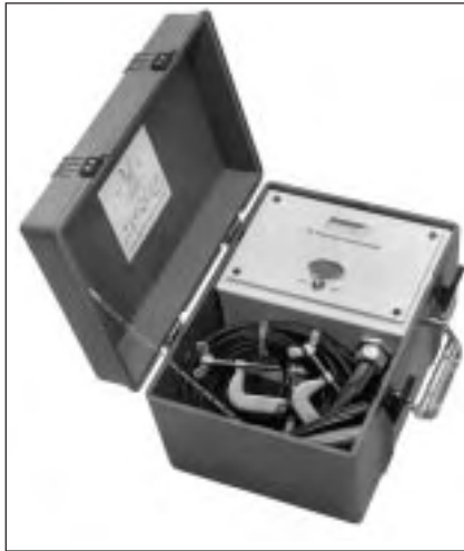
Auxiliary transformer for single-phase TTR

phase) and the configuration of the high- and low-voltage windings.