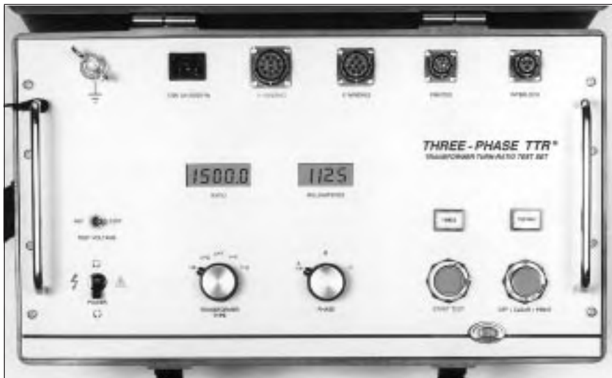
Select the transformer winding type and phase under test, press a button, and ratios are displayed automatically.

The header automatically includes the type of transformer (single- or three-