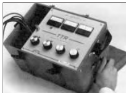
This single-phase TTR test set is operated by turning a crank.

for data transfer or for use with the optional lid-mounted printer.